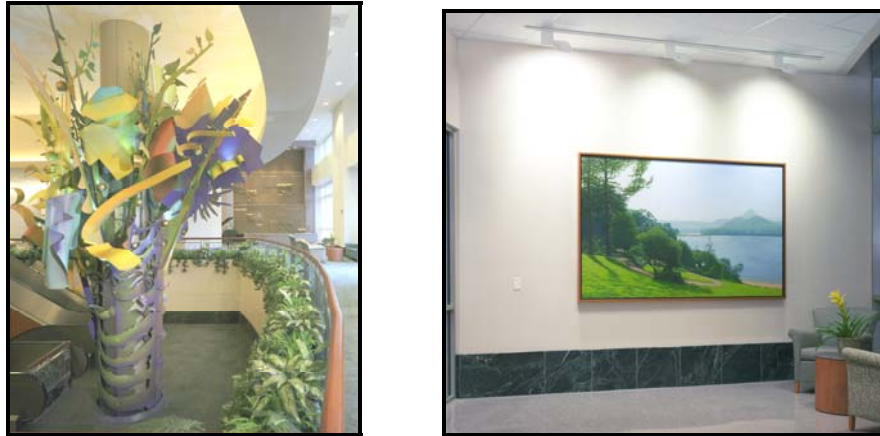
Fig 3. Left: The “Tree of Life” in the Lobby, Mays Clinic Right: First Floor Vestibule, Mays Clinic

In 2002, the University of Texas M. D. Anderson Cancer Center recognized the need to change the fundamentals of its art program from an art-for-art’s-sake approach to an evidence-based one; one that used previous research to determine appropriate art content for patients and staff in the hospital. The approach also committed to evaluating the results of any art intervention and collecting evidence on the effectiveness of the art intervention that was implemented. American Art Resources was given the responsibility to implement an art program based on guidelines developed from previous research, toward the following goals: