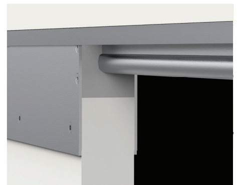
Close up of ligature resistant track system

Accurate Lock and Hardware wanted to create a solution that would eliminate self-harm risks inherent in swinging doors, and address privacy and health-related concerns associated with curtains.