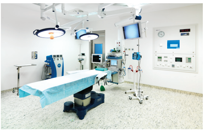
Hospital Virgen del Castillo (Murcia, Spain)

KRION K-LIFE's photocatalytic properties ensure a unique set of characteristics including the ability to: purify the air, eliminate chemical substances, expel bacteria and prevent it from spreading, and to resist breaking or staining through its hardness and durability. It also has the ability to bond with no visible joints making it easy to clean.