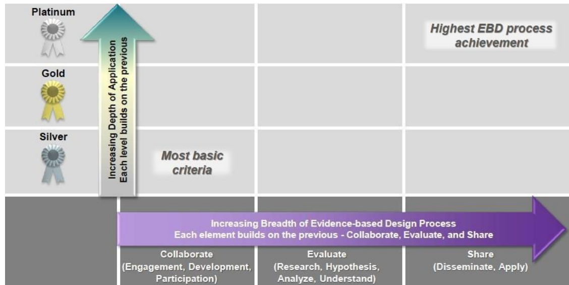
Figure A. Levels of Recognition