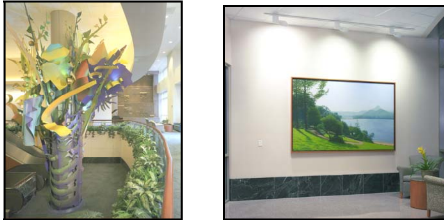
Fig 3. Left: The “Tree of Life” in the Lobby, Mays Clinic Right: First Floor Vestibule, Mays Clinic

In 2002, the University of Texas M. D. Anderson Cancer Center recognized the need to change the fundamentals of its art program from an art-for-art’s-sake approach to an evidence-based one; one that used previous research to determine appropriate art content for patients and staff in the hospital. The approach also committed to evaluating the results of any art intervention and collecting evidence on the effectiveness of the art intervention that was implemented. American Art Resources was given the responsibility to implement an art program based on guidelines developed from previous research, toward the following goals: