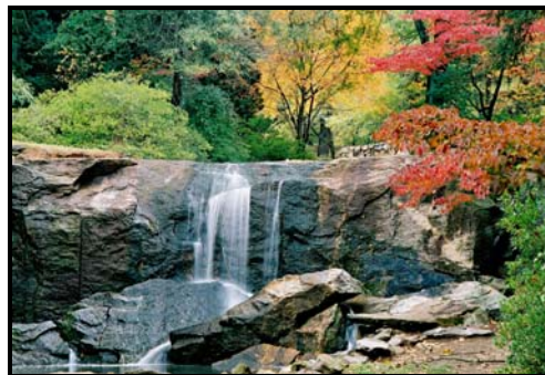
Fig1. Highest Ranking Image for Hospital In-patients

Hathorn and Nanda (2006) conducted an art preference study with inpatients in St. Luke's Episcopal Hospital in Houston, TX, and found that patients preferred nature scenes and representative images to stylized or abstract art, even when the latter were rated as bestsellers by different online art vendors. The study is yet another indicator that high-quality art, or even popular art, is not always appropriate art for healthcare settings. The study also showed that abstract images were not preferred, but generated more comments from patients. This indicates that evocative art is not synonymous with preferred art or, (one can hypothesize), restorative art.